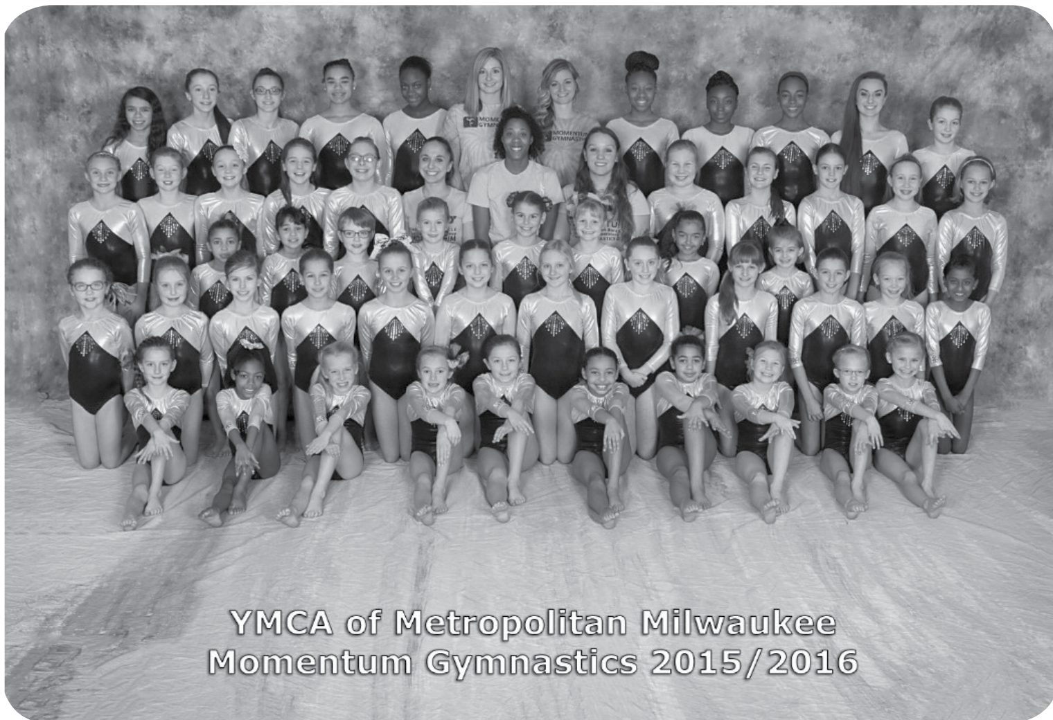
YMCA of Metropolitan Milwaukee Momentum Gymnastics 2015/2016