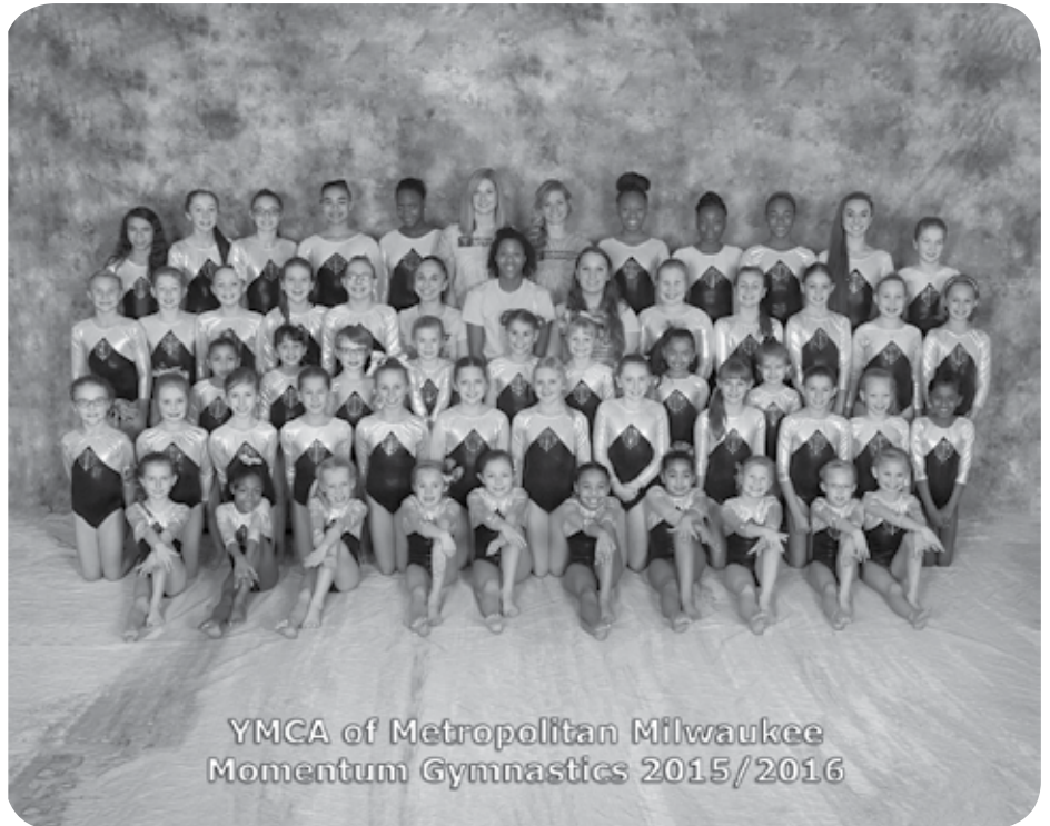
YMCA of Metropolitan Milwaukee Momentum Gymnastics 2015/2016